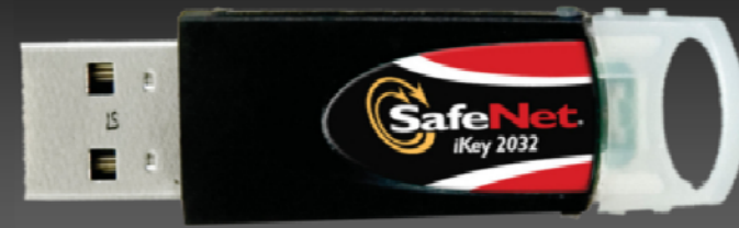
SafeNET iKey™ 2032 USB Cryptographic security comes as standard for all PersonalSign and PersonalSign professional solutions – Portable/Flexible/Reliable

CorporateRA Digital ID for Adobe includes two options for the Enterprise to manage the full life-cycle of Digital IDs issued under their organization name. i.e. Individual signing USB tokens or central-based credentials for either role-based signings or server held individual Digital IDs. Distributed implementations involve providing organization administrators (acting as the organization registration authority) a bulk shipment of Safenet USB tokens which work in conjunction with Acrobat Standard/Professional/3D. Centralized, server-based implementations work with SafeNet hardware security modules (optionally sold) that are highly integrated with Adobe's LiveCycle Enterprise Server suite. The net result is a highly automated solution with robust signing functionality..